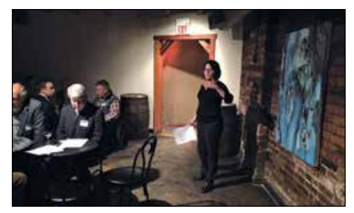
A wine expert provides detailed descriptions of the wine samples as they're presented.

Photos from the Wine Tasting can be found on the AMCNO Facebook page and Twitter feed. ■