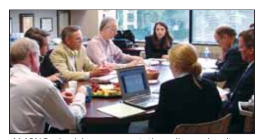
AMCNO physician representatives discuss key issues with MEDPAC and Mathematica staff.

The purpose of this meeting was to provide input into a study coordinated by Mathematica Policy Research. The final study will be provided to MedPAC — a congressional commission that advises Congress on Medicare payment issues. The Center for Medicare and Medicaid Services (CMS) is investigating