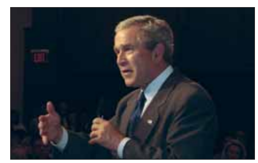
President Bush makes a point regarding electronic health records during his stop in Cleveland.

out the fee you will have to pay to have other services rendered a consumer should be able to obtain the cost for a service in medicine. The President noted that as an alternative to the federalization of health care there has to be alternatives and incentives built into the system such as health savings accounts and other methodologies that will allow the consumer to make health care spending choices — but in order to have these choices the consumer will need to be able to access cost information.