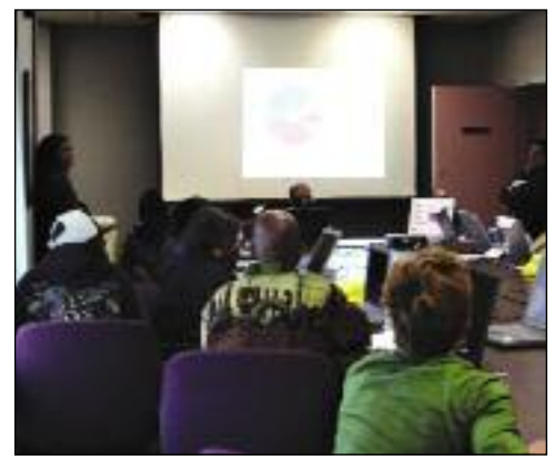
A group of uninsured individuals participate in the CHAT process at Saint Vincent Charity Hospital – an event co-sponsored by the AMCNO.

The Academy of Medicine of Cleveland & Northern Ohio supports physicians in being strong advocates for all patients as well as