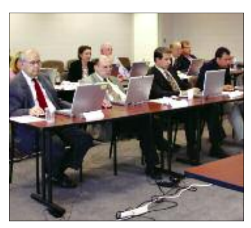
AMCNO physician leadership spend an evening working on the CHAT program.

As part of the 2008 Cover the Uninsured Week initiative, The Academy of Medicine of Cleveland & Northern Ohio (AMCNO) sponsored two Ohio CHATs about Healthcare sessions in May 2008.