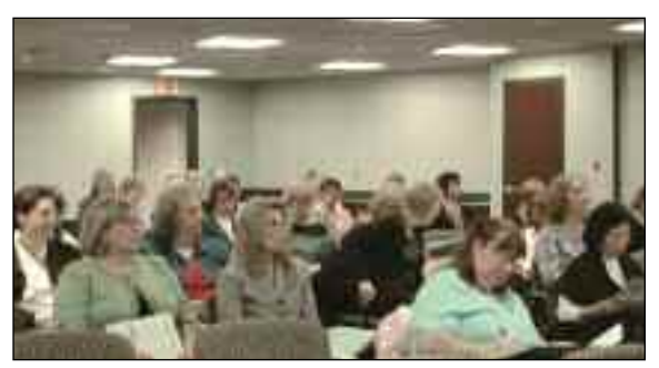
The AMCNO was pleased to host the CGS sessions at our offices where over 125 offices managers were on hand to learn more about the CGS transition.

CIGNA Government Services has changed their name as part of their acquisition by BlueCross BlueShield of South Carolina. Effective immediately, their name is CGS<sup>SM</sup>, LLC. This name change will not affect the transition process to CGS as Ohio's new Medicare Part B Carrier. This name change does not impact the transition process to CGS as Ohio's new Medicare Part B Carrier and it does not affect services, claims