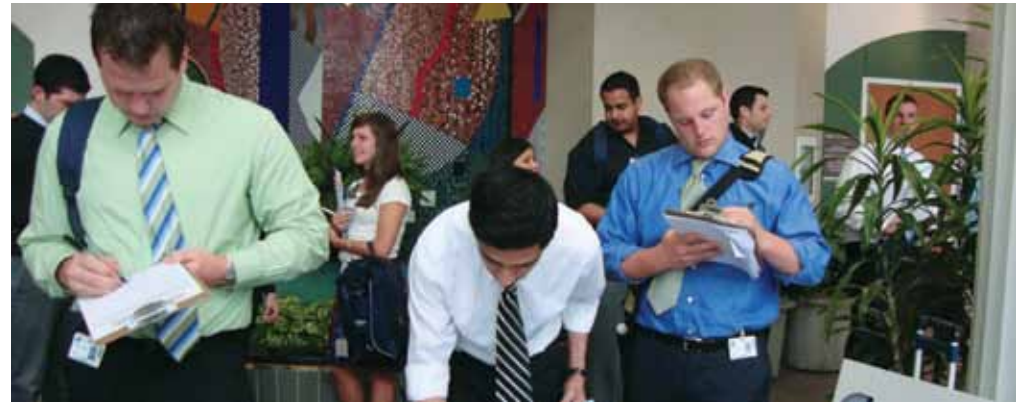
A group of residents from Metro take the time to fill out AMCNO membership applications at their orientation event.