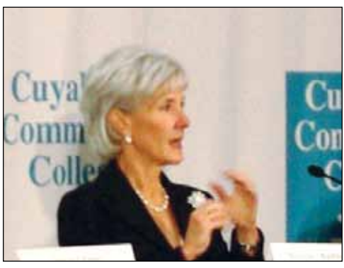
Secretary Sebelius responds to a question during the panel discussion.