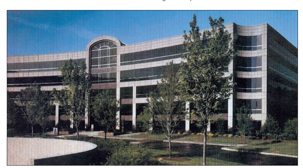
The new location of the Executive offices of The Academy of Medicine of Cleveland & Northern Ohio in the Park Center Plaza on Rockside Road.

As part of our recent strategic plan, and to coincide with moving to our new location, the Academy leadership agreed to consolidate our name. There was a lot of discussion about whether or not to retain the "Cleveland" in our name, and after reviewing the long history of the organization it was determined that the name would reflect our roots with the city as well as our extended focus of regional representation.