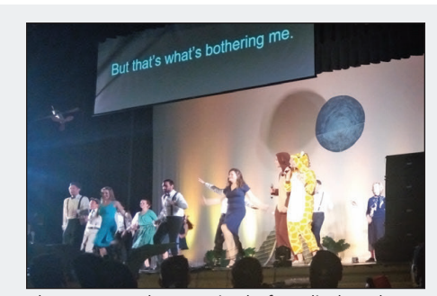
The cast, mostly comprised of medical students, perform a fun skit during the show.

In keeping with Case's commitment to give back to the community, the show's primary mission is to raise funds to provide quality healthcare and related services to individuals and families in our community regardless of their ability to pay through its beneficiaries: Circle