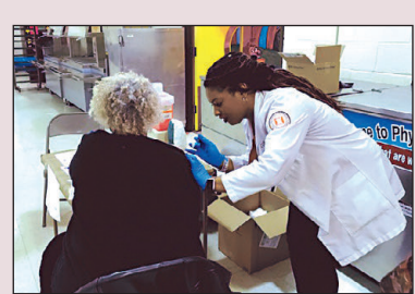
A voter receives a seasonal flu vaccination at her polling location.

The intent of this program is to provide individuals with an opportunity to receive a seasonal flu vaccination at a specific site in Cuyahoga County, making it easier for them to get vaccinated before