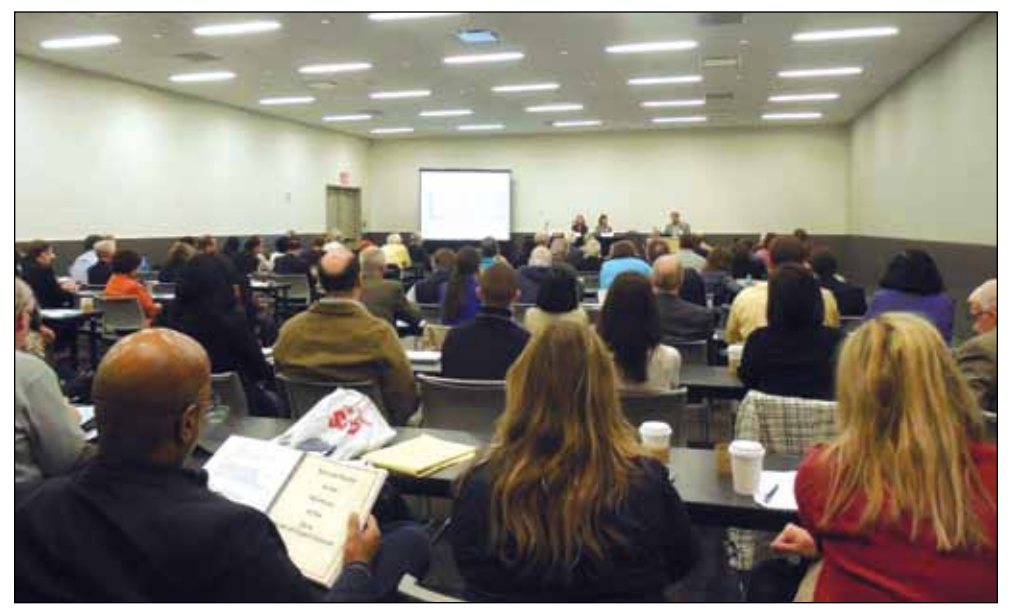
Participants received insights into fraud and abuse issues at the Saturday breakout session.