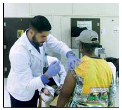
A voter receives an immunization at the Marion Sterling School in Cleveland.

The Academy of Medicine of Cleveland and Northern Ohio (AMCNO) hosted its 15th annual Vote and Vaccinate program on Election Day, November 4, 2014.