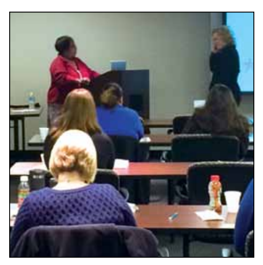
Healthcare representatives attend the annual Third-Party Payer seminar.

MyCare Ohio is the state's integrated care delivery system. It's a demonstration project integrating Medicare and Medicaid services into one program and is operated by a managed care plan. To be eligible for the program, an individual must be eligible for all Medicare parts and be fully eligible for Medicaid, over the age of 18, and reside in one of the seven demonstration project regions. (A map can be found here: <a href="http://medicaid.ohio.gov/Portals/0/For%20Ohioans/Programs/MyCareOhio/GeneralEd012014.pdf">http://medicaid.ohio.gov/Portals/0/For%20Ohioans/Programs/MyCareOhio/GeneralEd012014.pdf</a>)